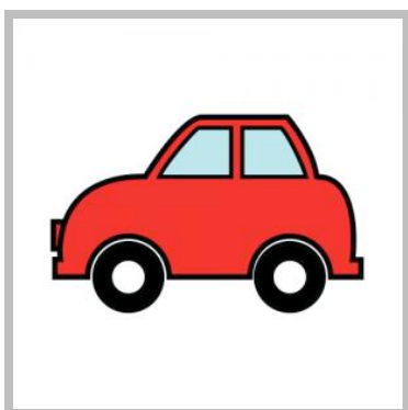
COCHE DE JUGUETE