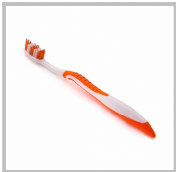
BROSSE A DENTS